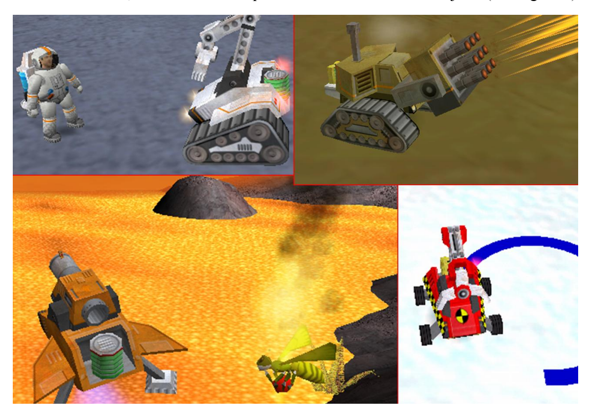
Figure 1. Screen capture from Ceebot showing a small section of 'bots' that may be programmed to move, pick up objects, shoot, fly (bottom left) and draw (bottom right).

Many learning and teaching applications therefore endeavor to make the subject less intimidating and more accessible to novice programmers through creative use of graphical and interactive development environments or immersive game-like interfaces. Widely used examples of such learning environments include: Alice (Cooper et al. , 2000); Lego Mindstorms (Barnes, 2002); BlueJ (Kölling et al. , 2003), Greenfoot (Henriksen & Kölling, 2004) and Scratch (Resnick et al. , 2009). In this study, students use the Ceebot application, designed for learning industry-standard C-language syntax and object-oriented principles (Huber, 2008; Maragos & Grigoriadou, 2005). Ceebot employs a dynamic landscape populated with robotic devices that may be programmed to interact with each other, 'alien' life and to perform tasks on inanimate objects (see Figure 1).