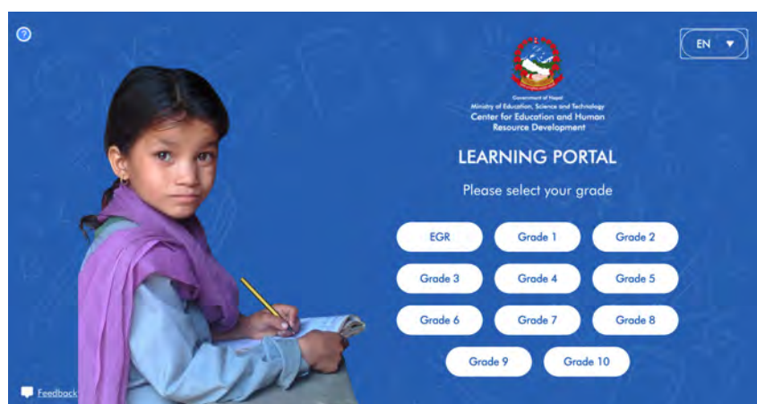
Figure 7: The landing page of the Learning Portal that includes a little girl's image

The first ever learning portal was developed by CEHRD during the pandemic, which is believed to have helped a large majority of the students and teachers. It comprises the lessons intended as self-learning materials for students of different levels. If utilized as intended, the materials appeared to be effective for maintaining the learning of the children during the emergency period. The authors question the sensitivity of the selection and use of a picture (Figure 7) which appears on the homepage of the learning portal. It is, of course, hard to understand the rationale behind using this picture on the homepage of the learning portal. Questions may arise such as, is the use of the picture on the homepage to show how curious a little girl is for learning which potentially can motivate other learners as well? Or is it to convey the visitors of this site the message that despite being from a low socioeconomic background, this girl is still interested in learning?