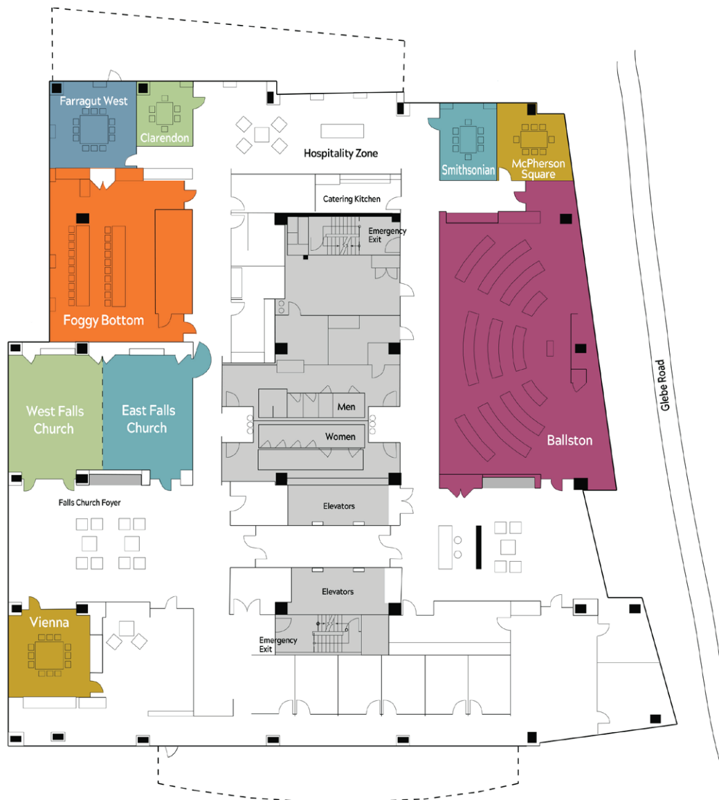
Virginia Tech Research Center - Arlington (Second Level)