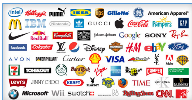
Figure 3: Contemporary Symbols

Symbolic perception of objects as meaningful signs is a sense-making activity which resides in the context of cultural and social groups. Charles Peirce (1976) elaborates that concept in Semiotic Triangle (Figure 2), acknowledging that objects used to represent something else have infinite semiotic capacity, since the equivocation of a sign is based on the decoding process, the degree of connection and relationship of the interpretant (signified message) to the representamen (sign), and mediation abilities of the interpreter (Salvatore, cited in Valsiner, 2012, p.245). Semiotician Daniel Chandler (2017), detaching from de Saussure's pioneering model, bracketing the referent, builds on the social principle of meaning-making by noting that communication and entertainment media, films, photography, television, have succeeded in making indigenous symbolic codes arbitrary in reflecting reality, yet are still discernible as cultural texts so long as social codes and conventions are adhered to, or understood, by the sense-maker.