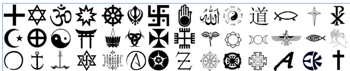
Figure 1: Religions and Their Symbols

Symbols as vital sociological communication forms representing religion and beliefs (Figure 1), are powerful embodiments of cultural traditions and heritage, concepts crucial in preserving social harmony (Tresidder, 2000). Swiss psychotherapist Carl Gustav Jung believed symbolism to be a crucial marker of individuals’ personality and self-identity, founded on one’s psychological subconscious and the collective unconscious, and the process of decoding their meanings in dreams and imageries associated with heroes, myths and archetypes produces awareness (Julien, 2012).